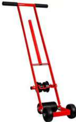
3M™ Lane Marking Applicator M1, 1 Each/Case

3M Stock Previous 3M Stock 7100030346 70006758950