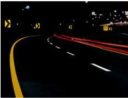
3M™ Stamark™ High Performance Tape Series 380IES