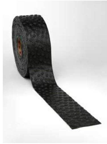
3M™ Starmark™ Removable Black Line Mask 700 Series