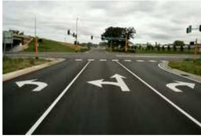
3M™ Stamark™ Pavement Marking Tape Series 270