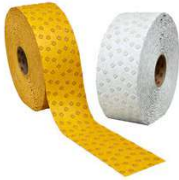
3M™ Starmark™ All Weather Removable Tape Series 710IR