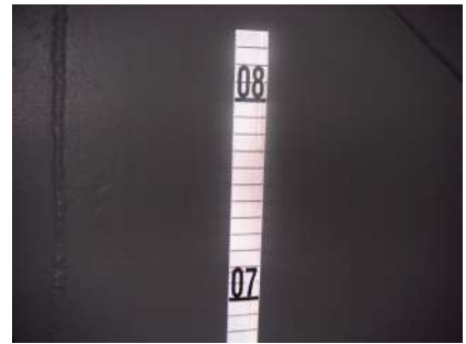
3M™ Diamond Grade™ Reflective Escape Trunk Markings 3MN056DG, 2 in x 15 yd