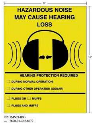
3M™ Diamond Grade™ Safety Signs, 200-299 Series