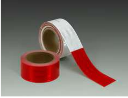
3M™ Diamond Grade™ Conspicuity Marking Kit 983-K2 for 53 ft Trailer