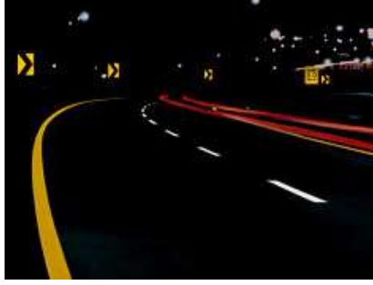
3M™ Stamark™ High Performance Tape Symbols & Legends Series 380IES