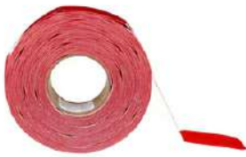
3M™ Diamond Grade™ Reflectors Series 989