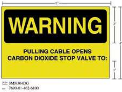
3M™ Diamond Grade™ Fire Fighting Signs, 300-399 Series