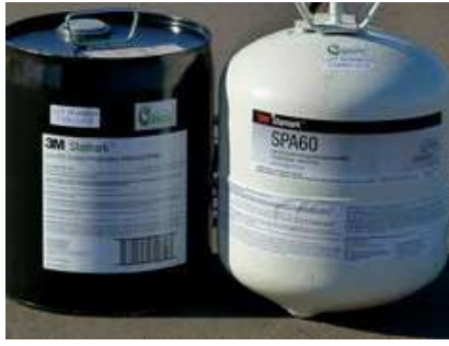
3M™ Stamark™ Surface Preparation Adhesive SPA60