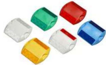
3M™ Raised Pavement Marker Series 290