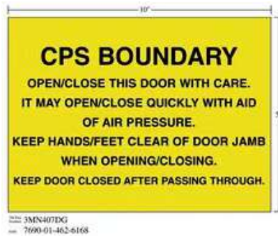
3M™ Diamond Grade™ Ventilation Signs, 400 - 499 Series