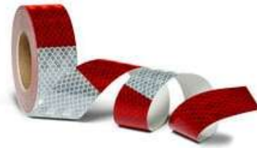
3M™ Flexible Prismatic Conspicuity Markings 913 Series