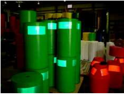
3M™ Diamond Grade™ Flexible Prismatic Conspicuity Markings Series USCGFP