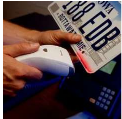
3M Inventory Management System (IMS) 3M Stock B5005178002