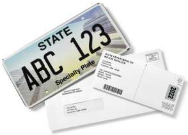
3M™ Direct Fulfillment System 3M Stock B5005176000