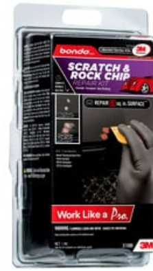
Bondo® Scratch and Rock Chip Repair Kit Clamshell, 31590, 6 kits per case