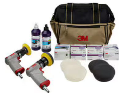
3M™ Perfect-It™ Headlight Lens Restoration Kit (Professional Use), 02516, 1 p... case