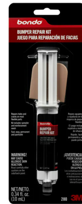
Bondo® Bumper Repair Kit Clamshell, 31589, 6 kits per case