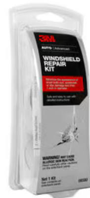
3M™ Windshield Repair Kit