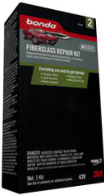
Bondo® Fiberglass Resin Repair Kit