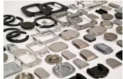
Mirror Button 3289A with 3M™ Structural Bonding Tape 9214, 280/Metal Roll