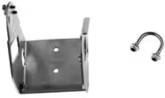
3M™ Dual Cutter Bracket PN99429