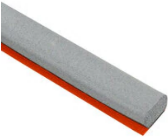
3M™ Mechanical Replacement Weight PN99427, 7mm x 14mm