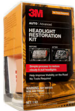
3M™ Headlight Restoration Kit, 39084, 4 per case