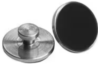
Pin 01 with 3M™ Structural Bonding Tape