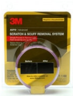
3M™ Scratch Removal System, 39071, 4 per case