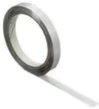
3M™ Wheel Weight Foil Splicing Tape 1555U