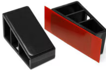
CHMSL Mounting Bracket with 3M™ Acrylic Plus Tape