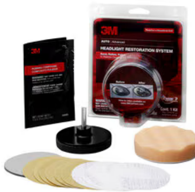
3M™ Headlight Lens Restoration System, 39008, 4 per case