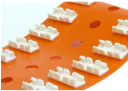
Roof Ditch Clips with 3M™ Structural Bonding Tape