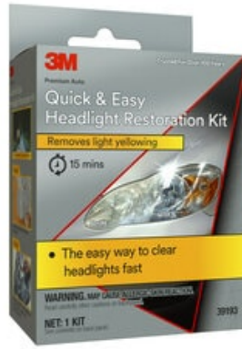
3M™ Quick and Easy Headlight Restoration Kit, 39193, 4 per case