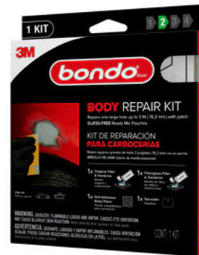
Bondo® Body Repair Kit BRKIT-2PK-ES, Ready Mix Pouches, 2 oz., 6/Case