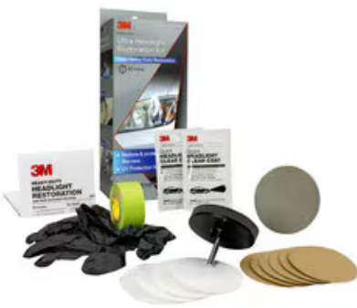
3M™ Ultra Headlight Restoration Kit 39195, 3/Case