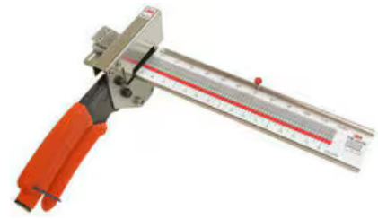
3M™ Universal Cutting Tool PN61479