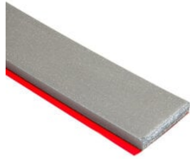
3M™ Wheel Weight TN4019