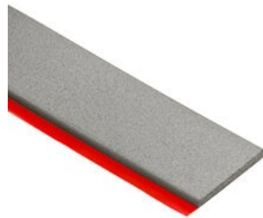
3M™ Wheel Weight TN4023