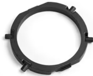
Rain Sensor Bracket with 3M™ Structural Bonding Tape