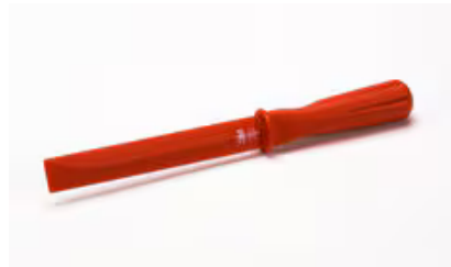
3M™ Removal Tool PN99099