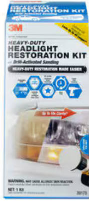
3M™ Headlight Restoration Kit