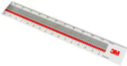
3M™ Replacement Ruler RR4020, PN55418