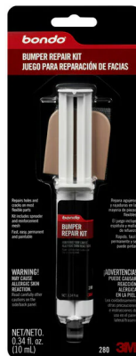
Bondo® Bumper Repair Adhesive Kit