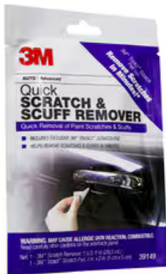
3M™ Scratch & Scuff Removal Kit