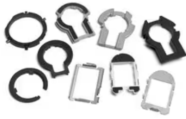
Camera Bracket CB01 with 3M™ Acrylic Foam Tape 5314