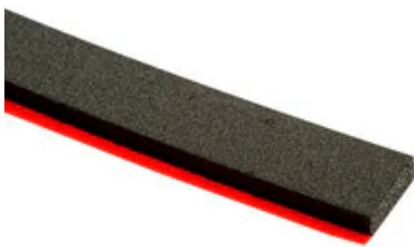
3M™ Wheel Weight TN6020