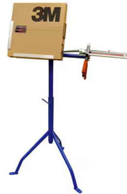
3M™ Wheel Weight Cutting Stand PN61480