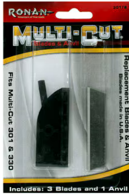
3M™ Replacement Kit PN61592, 3 blades and 1 anvil