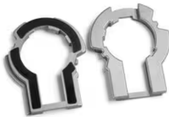
Rain Sensor Mirror Button Combo Brackets with 3M™ Structural Bonding Tape