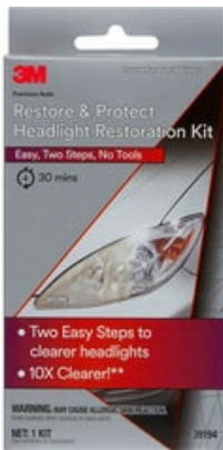
3M™ Headlight Restoration Kit, 39194, 4 per case