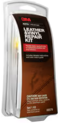
3M™ Leather and Vinyl Repair Kit, 08579, 3 per case