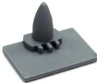
Locator Pins with 3M™ Acrylic Foam Tapes