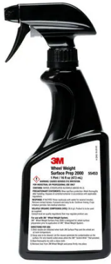
3M™ Wheel Weight Surface Prep 2000, PN55453