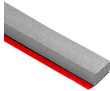
3M™ Wheel Weight TN4015