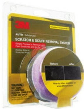
3M™ Scratch Removal System