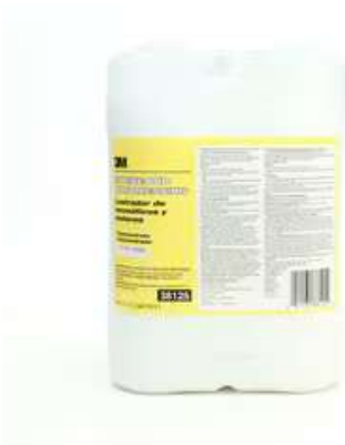
3M™ Engine and Tire Dressing, 38125, 5 Gallon, 1 per case