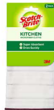
Scotch-Brite® Premium Microfiber Kitchen Cloth, 2/Pack, 12 Pack/Case