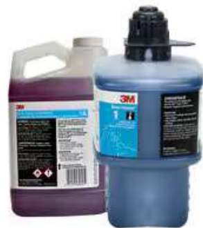
3M™ Glass Cleaner Concentrate