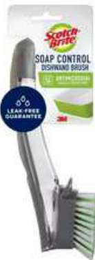
Scotch-Brite™ Advanced Soap Control Brush Scrubber Dishwand