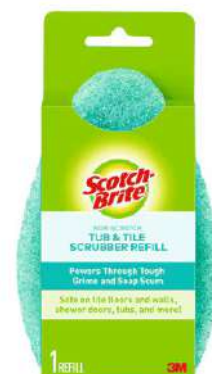
Scotch-Brite™ Non-Scratch Tub & Tile Scrubber Refill