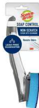
Scotch-Brite® Soap Control Scrub Dots Non-Scratch Dishwand 451A-4, 1 ea/pk, ... pks/cs