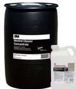
3M™ Neutral Cleaner Concentrate