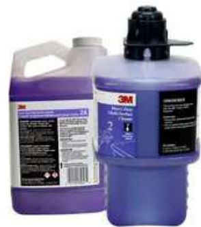
3M™ Heavy Duty Multi-Surface Cleaner Concentrate 2