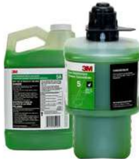
3M™ Quat Disinfectant Cleaner Concentrate 5