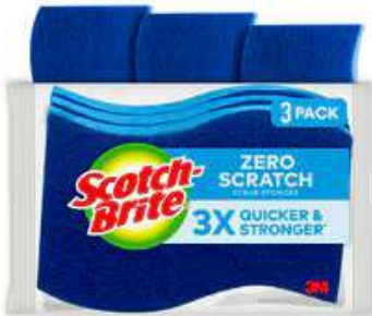
Scotch-Brite® Zero Scratch Scrub Sponge