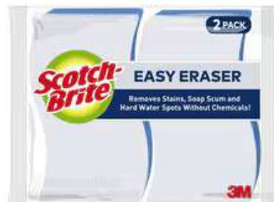
Scotch-Brite® Easy Eraser