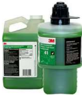
3M™ MBS Disinfectant Cleaner Fresh Scent Concentrate 41