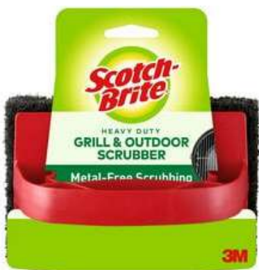
7721 SCOTCH-BRITE(TM) HVY DUTY GRILL SCRUB 12/CASE