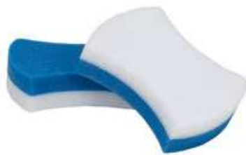
Scotch-Brite™ Easy Erasing Pad 4004