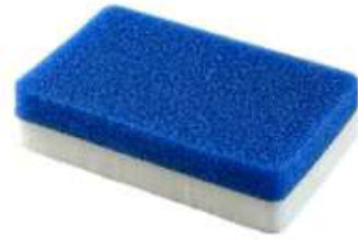
3M™ Scotch-Brite™ Jet Pad 4004JP, 6 in x 12 in, 50/Case