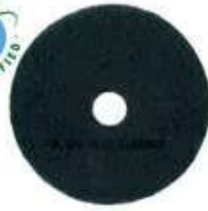
3M™ Blue Cleaner Pad 5300