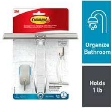
Command™ Bath Squeegee and Hook Stainless Steel and Satin Nickel, BATH32-SS-ES