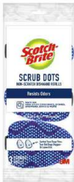
Scotch-Brite™ Scrub Dots Non-Scratch Dishwand Refills