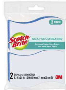
Scotch-Brite® Soap Scum Eraser 832B-2, 8/cs