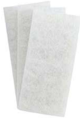
3M™ Doodlebug™ Utility Pad, 8440, 4-5/8 in x 10 in, White, 5/Box, 4, Boxes/Case