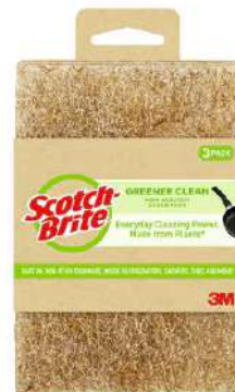
Scotch-Brite® Greener Clean Non-Scratch Scour Pad