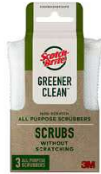
Scotch-Brite® Greener Clean Non Scratch Scrubbers 92773, 2.6 in x 4.1 in x 0.7 in (66 mm... 104 mm x 17 mm)