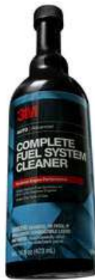
3M™ Complete Fuel System Cleaner