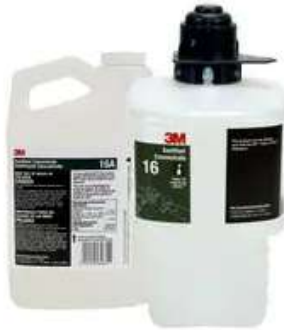
3M™ Sanitizer Concentrate 16