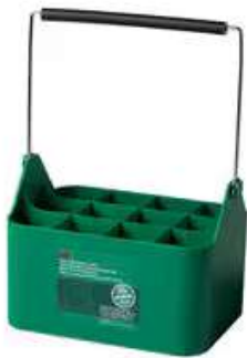
3M™ Easy Scrub Express Caddy, 6/Case