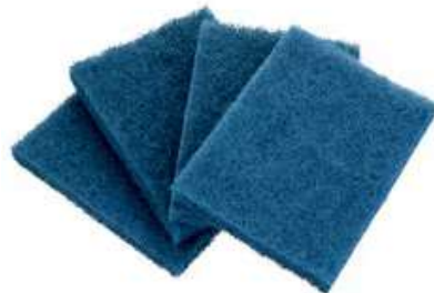
Scotch-Brite™ All Purpose Scouring Pad 9000