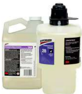
Scotchgard™ Pretreatment Cleaner Concentrate 28