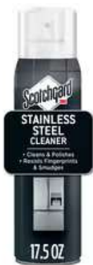
Scotchgard™ Stainless Steel Cleaner 7966-SG, 17.5 oz (495 g), 6/cs