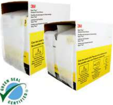
3M™ Easy Trap™ Sweep & Dust Sheets