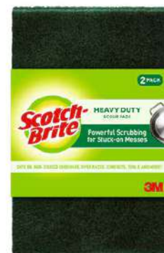
Scotch-Brite® Heavy Duty Scour Pad