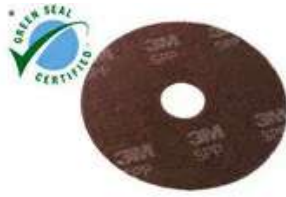
Scotch-Brite™ Surface Preparation Pads