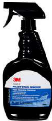
3M™ Marine Mildew Stain Remover, 09067, 16.9 fl. oz., 6 per case