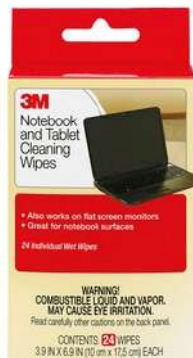
3M™ Cleaner Notebook Screen Cleaning Wipes CL630