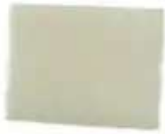
Scotch-Brite™ Light Duty Scrubbing Pad 9030, 3.5 in x 5 in, 40/Case