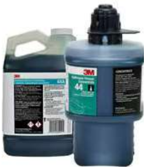
3M™ Bathroom Cleaner Concentrate 44L