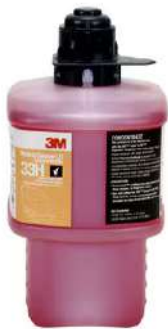
3M™ Neutral Cleaner LO Concentrate 33H, Gray Cap, 2 Liter, 6/Case