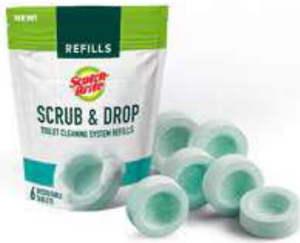
Scotch-Brite™ Scrub & Drop Toilet Cleaning System Refill 559-SD-RF-6, 6/6