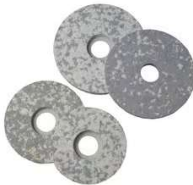
3M™ Melamine Floor Pads