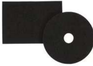
3M™ Black Stripper Pad 7200