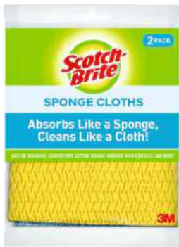
9055 SCOTCH-BRITE(TM) SPNG CLTH 61030 2PK 12 PACKS/CASE ENGLISH