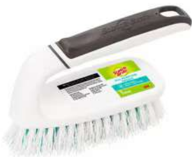
Scotch-Brite® Utility Brush 492, 6/1