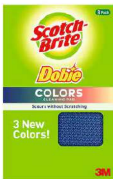
Scotch-Brite® Dobie™ Colors All Purpose Pads 723-C-8, 4.3 in x 2.6 in. x 0.5 in (111 mm x 68 ... x 14 mm), 8/3