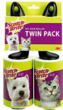
Scotch-Brite™ Pet Hair Roller 839RS-56TP, 112 Sheet Twin Pack