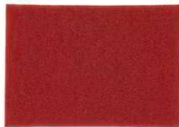
Scotch-Brite™ Red Buffer Pad 5100, Red, 711 mm x 356 mm, 28 in x 14 in, 10 ea/Case