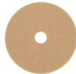
Niagara™ Tan Burnishing Pad 3400N