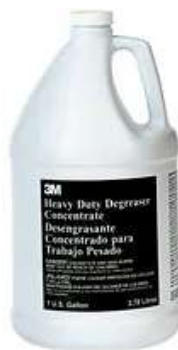
3M™ Heavy Duty Degreaser Concentrate 34782, 1 Gallon, 4/Case