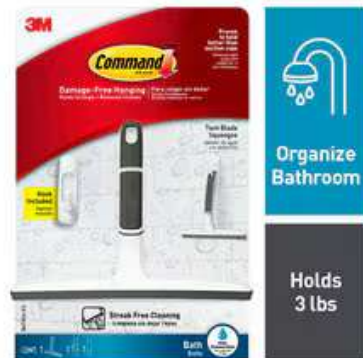
Command™ Twin Blade Squeegee w/Bath Hook & Strip, BATH24-ES