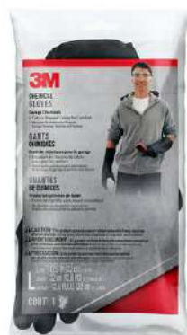
3M™ Heavy Duty Chemical Gloves, 90021, Large, 10/cs