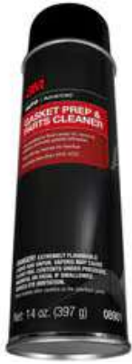
3M™ Gasket Prep and Parts Cleaner, 08901, 14 oz, 12 per case