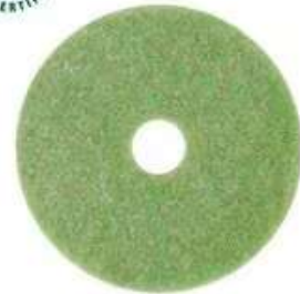
Scotch-Brite™ Autoscrubber Floor Pads 5000