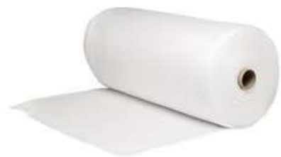
3M™ Oil Sorbent Roll HP-100, 960 mm x 40 m, 1 Roll/Case