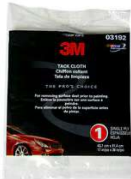
3M™ Tack Cloth