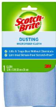
Scotch-Brite® Dusting Cloth