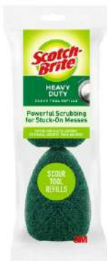
Scotch-Brite® Heavy Duty Kitchen Scrubber Refills 481- WB, 7/2