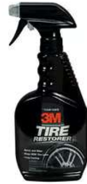
3M™ Tire Restorer