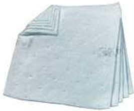
3M™ Oil Sorbent Sheets/Pads