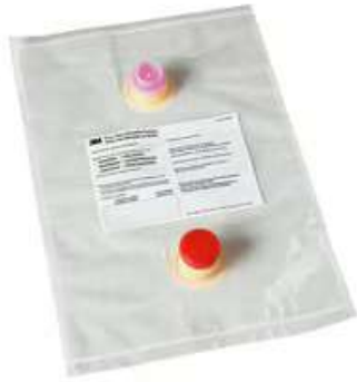
3M™ Easy Shine Reusable Pouches, 5/Case