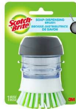
495 Scotch-Brite(TM) Soap Pump Brush