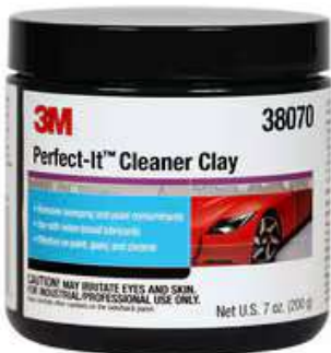
3M™ Perfect-It™ Cleaner Clay, 38070, 200 g, 1 bar per bottle, 6 bottles per case