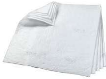
3M™ Petroleum Sorbent Static Resistant Pad