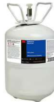
3M™ Adhesive Remover, Mini Cylinder, (Net Wt 8.5 lb), 1 Each/Case