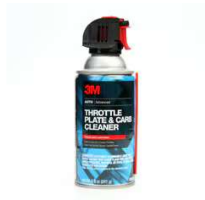
3M™ Throttle Plate and Carb Cleaner