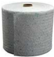
3M™ Petroleum Sorbent Roll Medium Capacity MCP, 15 in x 150 ft, 1 Roll/Case