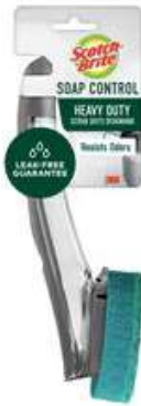
Scotch-Brite™ Soap Control Heavy Duty Scrub Dots Dishwand