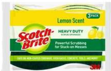
Scotch-Brite® Scented Heavy Duty Scrub Sponge HD-3F, 12/3