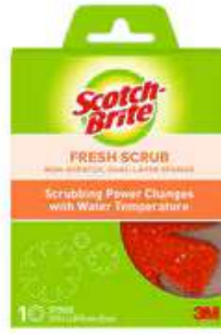
736-SW-1 Scotch-Brite(R) Fresh Scrub Sponge, 6/1