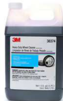
3M™ Heavy Duty Wheel Cleaner