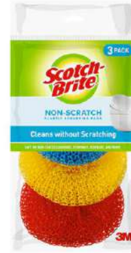
Scotch-Brite® All Surface Scrubbing Pad, 215-FW 3 pack, 12-3 Pks/cs