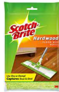
Scotch-Brite™ Microfiber Hardwood Floor Mop Refill M-005-R, 5.5 in x 16 in x 2.5 i... 6/cs