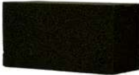
Grill-Brick™ Grill Cleaner GB12, 3.5 in x 4 in x 8 in, 12/Case