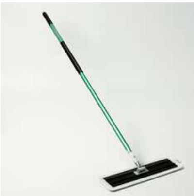
3M™ Easy Scrub Flat Mop Tool With Pad Holder, 16 in, 1/Case