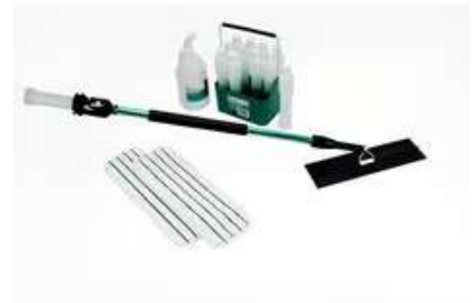
3M™ Easy Scrub Express Starter Kit, 1/Case