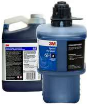
3M™ Speed Stripper Concentrate 6