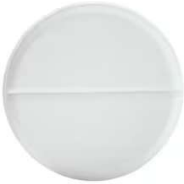
3M™ C. diff Solution Tablets