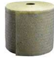
3M™ Chemical Sorbent Roll Medium Capacity MCC