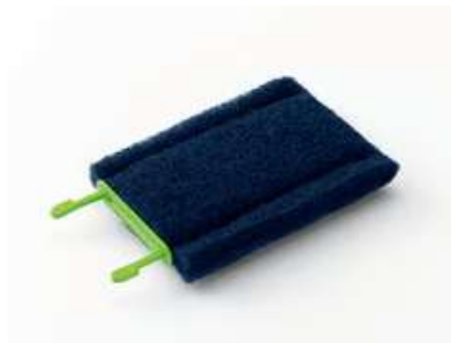
Scotch-Brite™ Low Scratch Blue Cleaning Pad 903