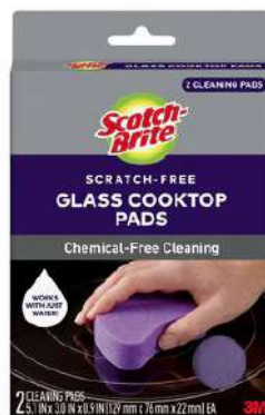
Scotch-Brite™ Glass Cooktop Pads 953-CT-P, 4.1 in x 3.4 in x 1 in (104 cm x 86 m x 25), 6/2