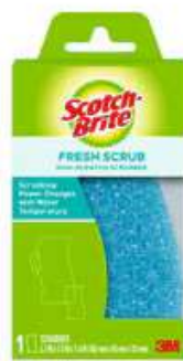
Scotch-Brite® Scrub Fresh Scrubber 735-SW-1, 6/1