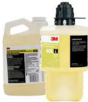
3M™ Heavy Duty Glass Cleaner Concentrate