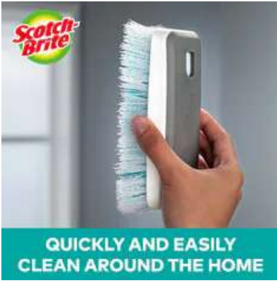
Scotch-Brite® Deep Clean Brush