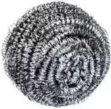
Scotch-Brite™ Stainless Steel Scrubber