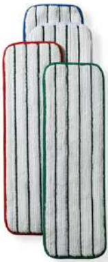
3M™ Easy Scrub Microfiber Flat Mop