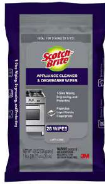
Scotch-Brite™ Appliance Cleaner & Degreaser Wipes 954-MAW-28, 6/1