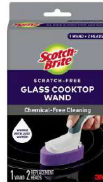
Scotch-Brite™ Glass Cooktop Cleaner 950-CT-W, 4/1