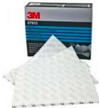
3M™ Tack Pad 07910, 175 mm x 235 mm, 10/Case, 60 ea/Case