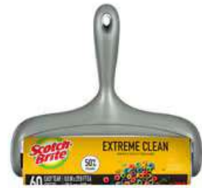
Scotch-Brite™ 50% Stickier Large Surface Lint Roller