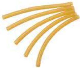
3M™ Easy Shine Replacement Dispensing Tube, 5 Tubes/Bag, 1 Bag/Pack