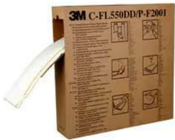
3M™ Chemical Sorbent Folded C-FL550DD, 127 mm x 15.2 m, 3 ea/Case