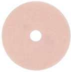
Scotch-Brite™ Eraser Burnish Floor Pads 3600