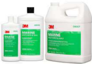
3M™ Marine Fiberglass Restorer and Wax, 09007, 1 gal, 2 per case