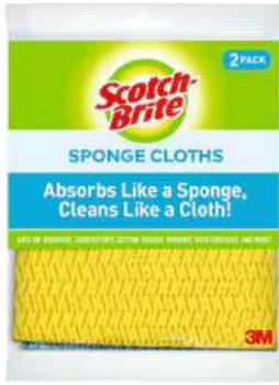
Scotch-Brite® Sponge Cloth 9055, 6.8 in x 7.8 in x 0 in (17 cm x 19 cm), 12/2