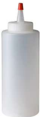
3M™ Detailing Squeeze Bottle, 37720, 12 fl oz, 24 per case