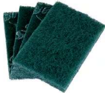
Scotch-Brite™ General Purpose Scrub Pad 9650, 3 in x 4.5 in, 40/Box, 2 Boxes/Case