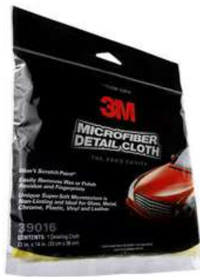
3M™ Microfibre Detailing Cloth