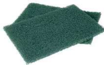
Scotch-Brite™ Heavy Duty Scour Pad 86