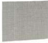
Scotch-Brite™ Griddle Screen 200