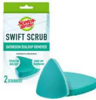
Scotch-Brite® Swift Scrub Bathroom Buildup Remover 835T, 3.8 in x 4.4 in x 0.8 in (... mm x 111 mm x 20 mm), 2 ea/pk, 8 pk...