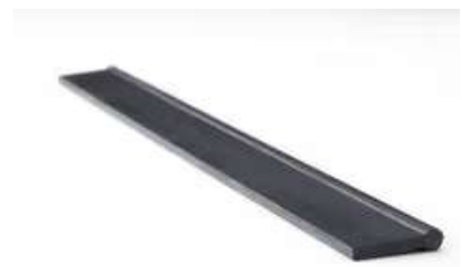
Scotch-Brite™ Squeegee Replacement Blade 411, 7.75 in., 6/Case