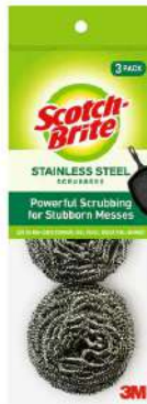
Scotch-Brite® Stainless Steel Scrubbers