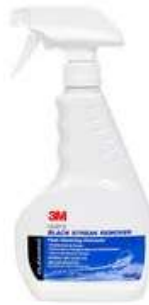
3M™ Marine Black Streak Remover, 500 mL Spray, 6 per case