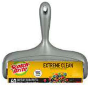
Scotch-Brite™ 50% Stickier Large Surface Lint Roller 830LSRS-60, 8 in x 31.4 ft (20... cm x 9.57 mm), 4 per case