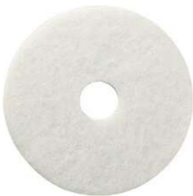
3M™ Osceola White Utility Pad 401