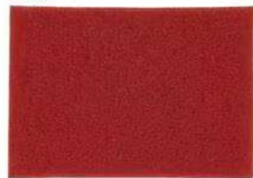
Scotch-Brite™ Red Buffer Pad 5100, Red, 508 mm x 356 mm, 20 in x 14 in, 10 ea/Case