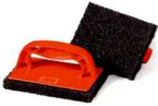
Scotch-Brite™ Scotchbrick™ Griddle Scrubber 9537