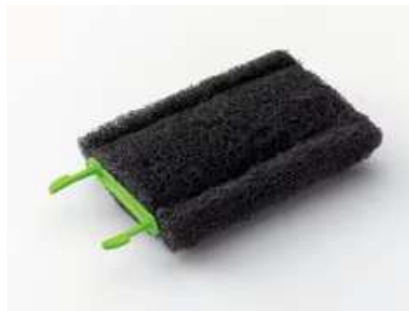
Scotch-Brite™ Heavy Duty Gray Cleaning Pad 901