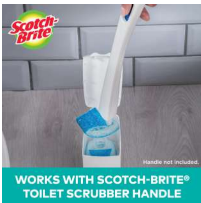
Scotch-Brite® Disposable Toilet Scrubber Refills