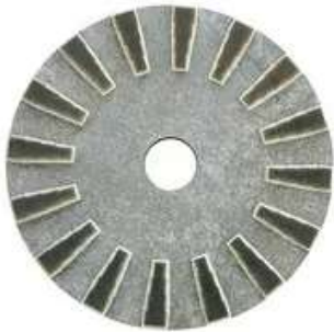
Scotch-Brite™ Diamond Floor Brush 1000