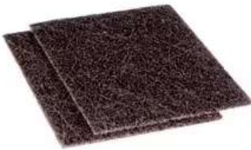
Scotch-Brite™ Heavy Duty Griddle Pad 82, 4.5 in x 5.5 in, 10/Box, 4 Boxes/Case