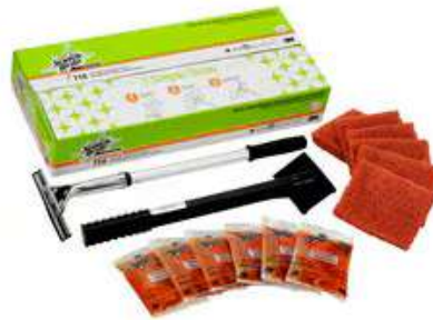
Scotch-Brite™ Quick Clean Griddle Cleaning System Starter Kit 710, 1/Case