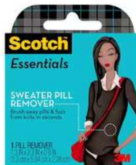
Scotch™ Essentials Sweater Pill Remover, W-110-A, 1 each