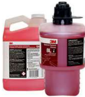
3M™ General Purpose Cleaner Concentrate 8