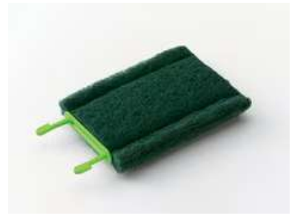
Scotch-Brite™ Medium Duty Green Cleaning Pad 902