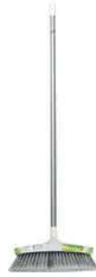
Scotch-Brite™ Indoor Broom, B760ES-US, 6 per case