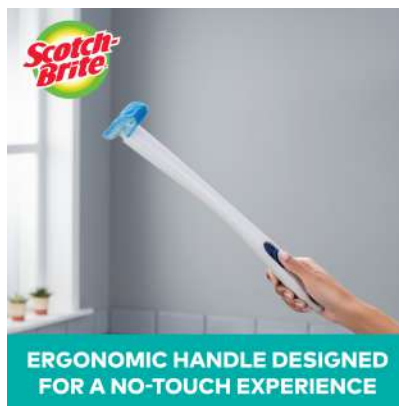
Scotch-Brite® Disposable Toilet Scrubber