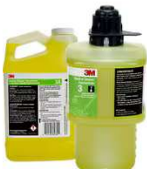
3M™ Neutral Cleaner Concentrate 3