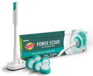
Scotch-Brite™ Power Scour Toilet Cleaning System 559-PS-SK-4, 4/1