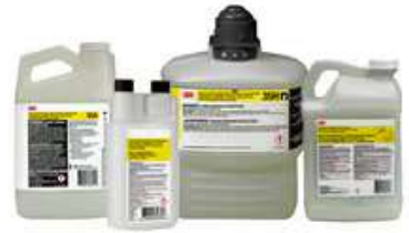
3M™ Clean & Shine Daily Floor Enhancer