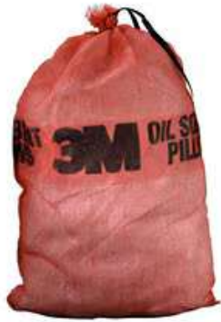
3M™ Oil Sorbent Pillows