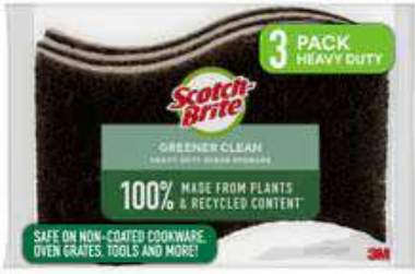
Scotch-Brite® Greener Clean Heavy Duty Scrub Sponge