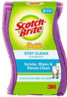
Scotch-Brite® Clean Rinse Scrubber 202, 4.5 in x 2.7 in, 12/2