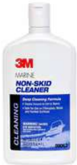
3M™ Marine Non-Skid Cleaner, 1 L (33.8 fl oz), 6 per case