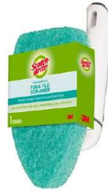
Scotch-Brite® Bathroom Scrubber 553-T, 6/1, 1 pack