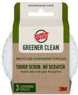
Scotch-Brite® Greener Clean™ Recycled Scrubbing Circles 215- GC, 6/3