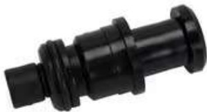
3M™ Easy Scrub Top Button, 30 Each/Case