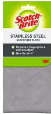
9064-1 SCOTCH-BRITE(R) STAINLESS STEEL CLEANING CLOTH 12/CS