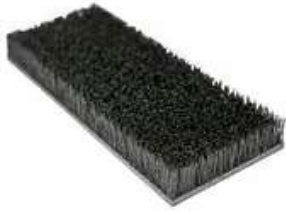
3M™ Doodlebug™ General Purpose Brush 4020, 8/Case