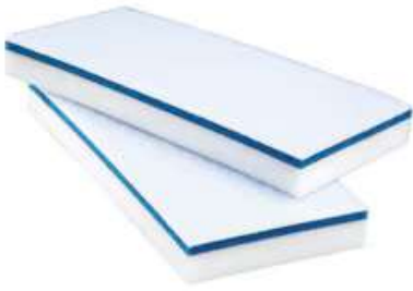
3MT DoodlebugT Easy Erasing Pad 4610, 5/Box, 4 Boxes/Case