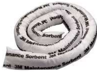
3M™ Maintenance Sorbent Mini-Boom