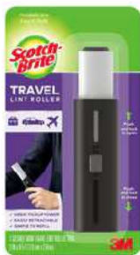
Scotch-Brite™ Mini-Travel Lint Roller Tool 836MRS-30-MT, 3 in x 8.5 ft (7.6 cm x 2.59 m), 6/1