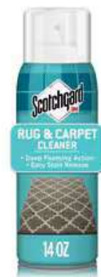
Scotchgard Rug and Carpet Cleaner