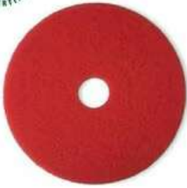
Scotch-Brite™ Red Buffing Pad 5100N, Red, 255 mm, 10 in, 5 ea/Case