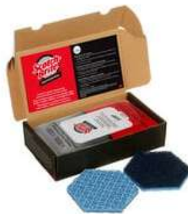
Scotch-Brite™ Kitchen Cleaner and Degreaser Starter Kit, 1/Case