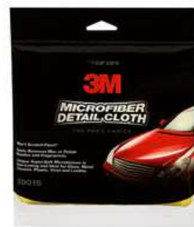
3M™ Microfiber Detail Cloth Clip Strip 39016, Yellow, 1/pk, 12/1