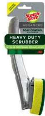
Scotch-Brite™ Soap Control Heavy Duty Dishwand