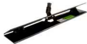
3M™ Easy Trap™ Sweep & Dust Sheets Flip Holder, 23 in, 6 Inner Packs, 6/Case