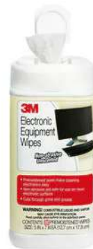
3M™ Antistatic Wipes CL610