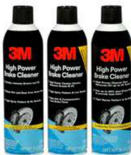
3M™ High Power Brake Cleaner