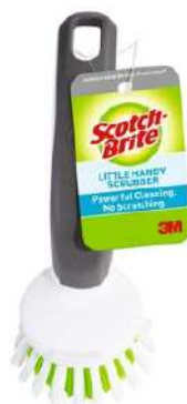
Scotch-Brite® Little Handy Scrubber 505, 12/cs, 1 pack