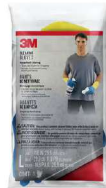
3M™ Household Cleaning Gloves