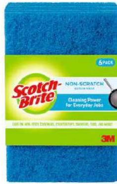
Scotch-Brite® Non-Scratch Scour Pads