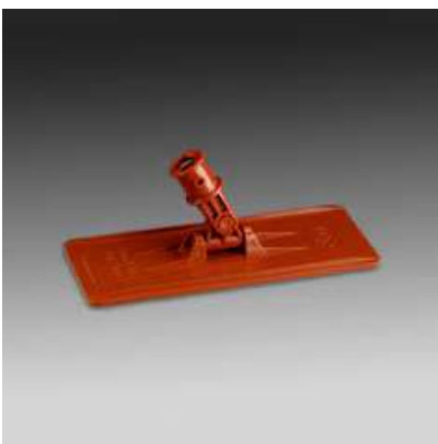
3M™ Doodlebug™ Pad Holder 6472 With Pads