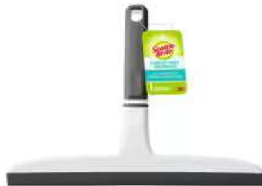
Scotch-Brite® Streak-Free Squeegee