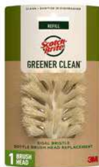
Scotch-Brite® Greener Clean™ Bottle Brush Replacement Head 509GC-6-RF, 6/1