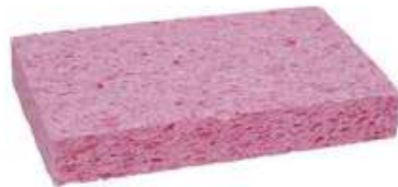
Scotch-Brite™ Sponge A21, 2/Pack, 24 Pack/Case