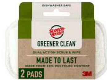
Scotch-Brite® Greener Clean™ Dual Action Scrub & Wipe 92773-2-SW, 4.7 in x 2.8 in x ... in (119 mm x 71 mm x 17 mm), 6/2