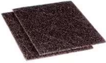
Scotch-Brite™ Heavy Duty Griddle Pad 82, 4.5 in x 5.5 in, 10/Box, 4 Boxes/Case