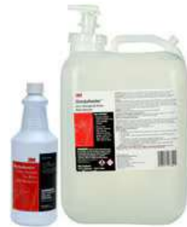
3M™ Sharpshooter™ Extra Strength No-Rinse Mark Remover