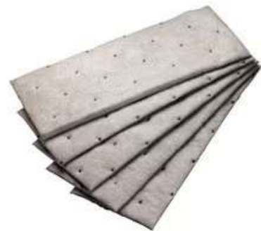
3M™ Maintenance Sorbent Production Pad