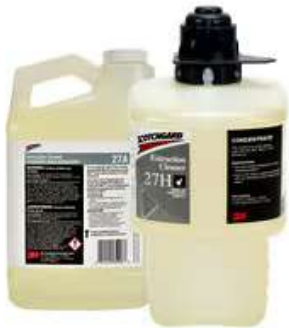
Scotchgard™ Extraction Cleaner Concentrate 27