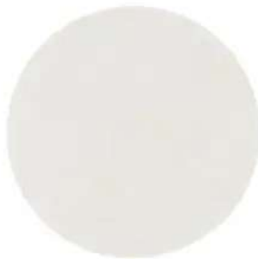
3M™ Carpet Bonnet White Pad