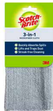
Scotch-Brite® 3-in-1 Microfiber Cloth 9070-M, 12/1, 1 pack