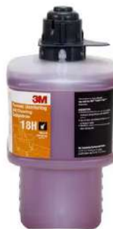
3M™ Phenolic Disinfecting and Cleaning Concentrate 18