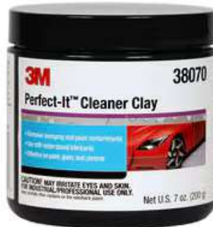
3M™ Perfect-It™ Cleaner Clay, 38070, 200 g, 1 bar per bottle, 6 bottles per case