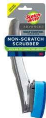
Scotch-Brite™ Soap Control Non-Scratch Dishwand