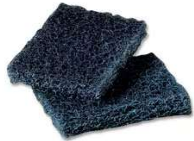
Scotch-Brite™ Extra Heavy Duty Pot 'n Pan Scour Pad 88