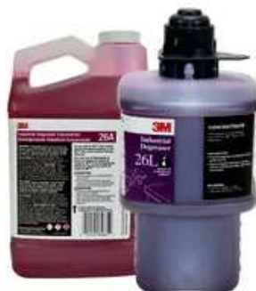
3M™ Industrial Degreaser Concentrate 26