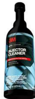
3M™ Injector Cleaner