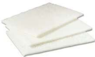
Scotch-Brite™ Light Duty Cleansing Pad 98