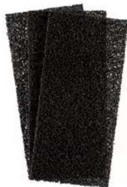
3M™ Doodlebug™ Hi Pro Utility Pad 8550, 4-5/8 in x 10 in, Black, 10/Box, 4 Boxes/Case