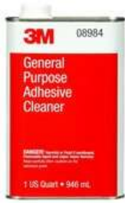
3M™ General Purpose Adhesive Cleaner