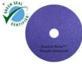
Scotch-Brite™ Diamond Purple Floor Pads