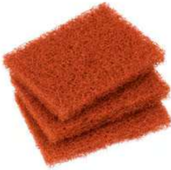
Scotch-Brite™ Quick Clean Heavy Duty Griddle Pad 746