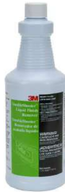
3M™ TroubleShooter™ Liquid Finish Remover, 1 Quart, 6/Case