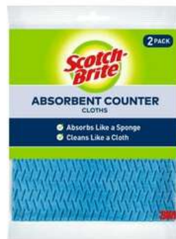
Scotch-Brite® Absorbent Counter Cloths 9055B-2