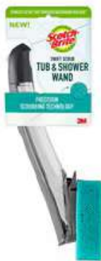
Scotch-Brite® Swift Scrub Tub & Shower Wand 547-W, 4/1