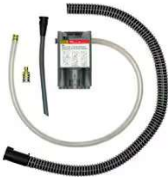
3M™ Twist 'n Fill™ Cleaning Chemical Dispenser