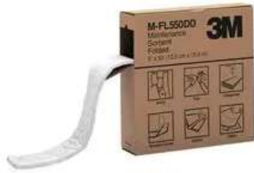
3M™ Maintenance Sorbent Folded M-FL550DD, 127 mm x 15.2 m, 3 Ea/Case