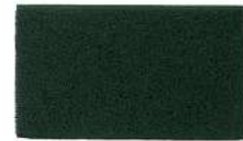
Scotch-Brite™ Medium Duty Scrub Sponge 74