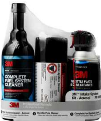
3M™ Intake System Cleaner