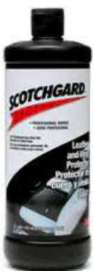
Scotchgard™ Leather and Vinyl Protector