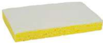
Scotch-Brite™ Light Duty Scrub Sponge 63, 6.1 in x 3.6 in x 0.7 in, 20/Case