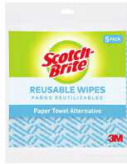
Scotch-Brite Reusable Kitchen Wipe 9053