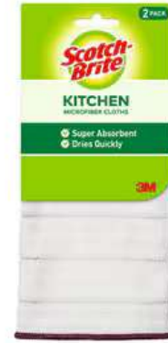
Scotch-Brite® Microfiber Kitchen Cloth