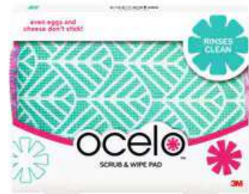
ocelo™ Scrub and Wipe 8220SW, 4.5 in x 2.7 in x .6 in, 12/1, 1 pack