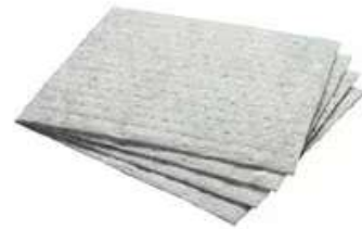
3M™ Petroleum Sorbent Pad Medium Capacity MCP