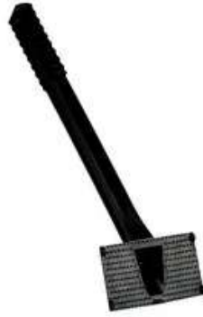
Scotch-Brite™ Multi-Purpose Pad Holder 405-R, 4.7 in x 2.8 in x 16 in, 1/case