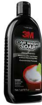
3M™ Auto Care Car Wash Soap