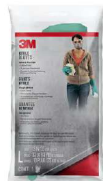
3M™ Nitrile Gloves