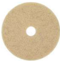
Niagara™ Natural Tan Hog's Hair Pad 3500N, 20 in, 5/Case