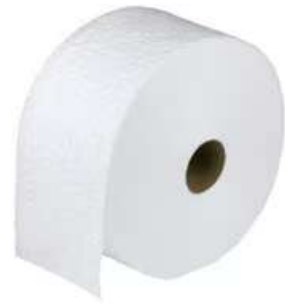
3M™ Doodleduster Cloth