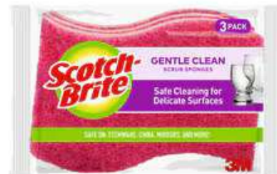
Scotch-Brite® Gentle Clean Scrub Sponge