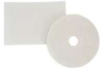
3M™ White Super Polish Pad 4100