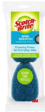
Scotch-Brite® Non-Scratch Kitchen Scrubber Refills 483-WB, 7/2