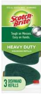
Scotch-Brite™ Heavy Duty Dishwand Refills