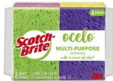
Scotch-Brite® ocelo™ Handy Sponge