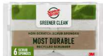
Scotch-Brite® Greener Clean™ Non-Scratch Scrub Sponge