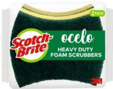
Scotch-Brite® ocelo™ Heavy Duty Foam Scrubber, HD2-UR-M, 8/2