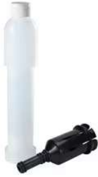
3M™ Easy Scrub Express Bottle