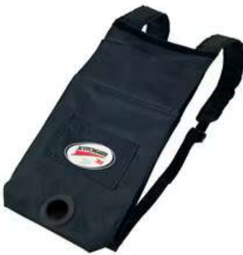
3M™ Easy Shine Canvas Backpack, 1 Each/Case