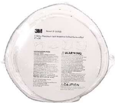
3M™ Petroleum Sorbent Spill Kit