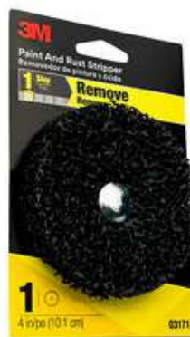
3M™ Light Rust and Paint Stripper, 03173, 24 per case