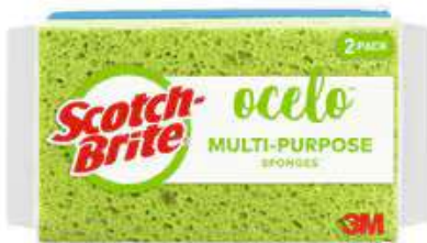
Scotch-Brite® ocelo™ Utility Sponges