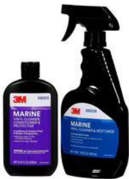
3M™ Marine Vinyl Cleaner and Restorer