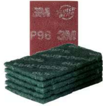
Scotch-Brite™ General Purpose Scour Pad 96