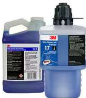
3M™ Glass Cleaner and Protector Concentrate