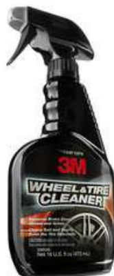
3M™ Wheel and Tire Cleaner