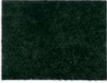
Scotch-Brite™ General Purpose Scouring Pad 105, 4.5 in x 6 in, 40/Case