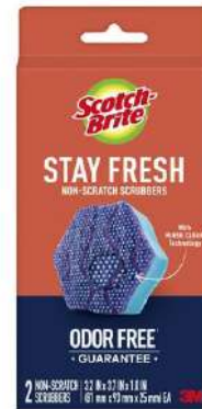
Scotch-Brite® Stay Fresh Non-Scratch Scrubbers SDA-2, 7/2