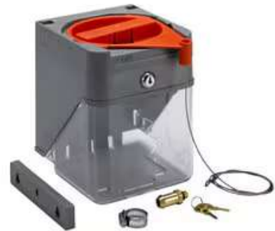
3M™ Twist 'n Fill™ Dispensing System Cabinet, 1/Case