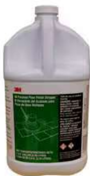
3M™ All Purpose Floor Finish Stripper, 1 Gallon Bottle, 4 Bottles/Case