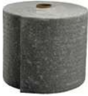
3M™ Maintenance Sorbent Roll Medium Capacity MCM