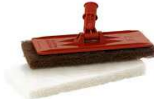
3M™ Doodlebug™ Introductory Kit, 1 Kit/Case