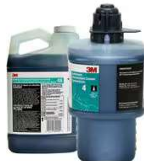
3M™ Bathroom Disinfectant Cleaner Concentrate 4