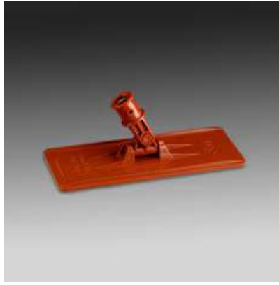
3M™ Doodlebug™ Pad Holder 6472 With Pads