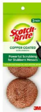
Scotch-Brite® Copper Coated Scrubbing Pad