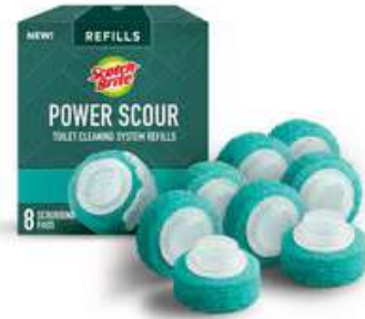
Scotch-Brite™ Power Scour Disposable Scrubbing Pad Refills 559-PS-RF-6, 4/8