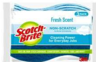
Scotch-Brite® Non-Scratch Scrub Sponge MP-3F, 12/3