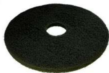
Niagara™ Green Scrubbing Pad 5400N, 20 in, 5/Case