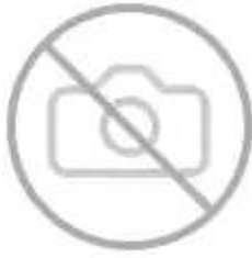
3M™ Chemical Sorbent Pad C-PD914DD, High Capacity, 9 in x 14 in, 25 Pads/Box, 6... Box/Case