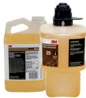
3M™ HB Quat Disinfectant Cleaner Concentrate 25