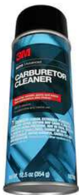
3M™ Carburetor Cleaner