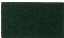
Scotch-Brite™ Medium Duty Scrub Sponge 74