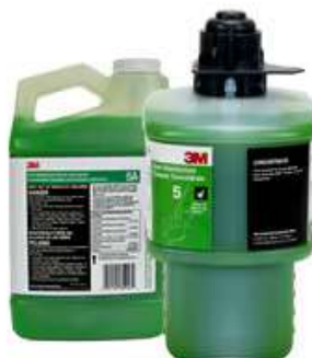
3M™ Quat Disinfectant Cleaner Concentrate 5