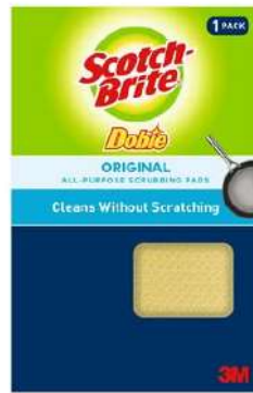
Scotch-Brite® Dobie™ All Purpose Cleaning Pad