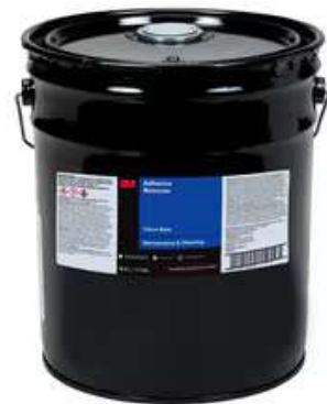
3M™ Bulk Adhesive Remover Citrus Base