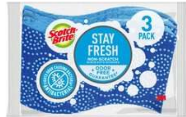
Scotch-Brite® Stay Fresh Non-Scratch Scrub Dots Sponges