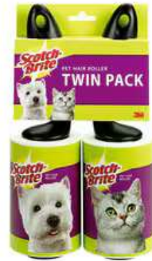
Scotch-Brite™ Pet Hair Roller 839RS-56TP, 112 Sheet Twin Pack