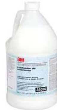
3M™ Interior Dressing, 38087, 5 Gallon, 1 per case