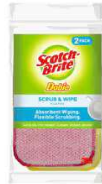
Scotch-Brite® Dobie™ Scrub & Wipe Cloth 9057-2, 12/2