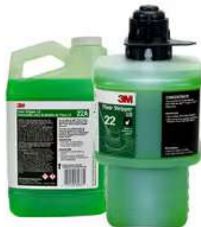
3M™ Floor Stripper LO Concentrate 22