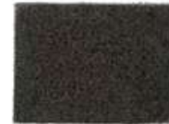
Scotch-Brite™ Griddle Polishing Pad 46