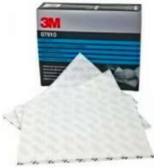
3M™ Tack Pad 07910, 175 mm x 235 mm, 10/Carton, 60 ea/Case