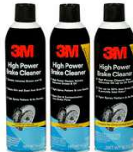
3M™ High Power Brake Cleaner