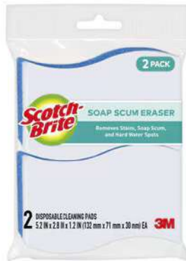
Scotch-Brite® Soap Scum Eraser 832B-6, 6/2