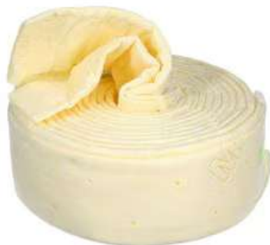
3M™ Chemical Sorbent Folded Spill Kit C-SKFL5/07175, 5 Gallons, 3 Each/Case