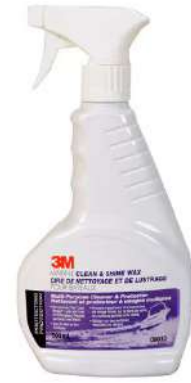
3M™ Marine Clean & Shine Wax