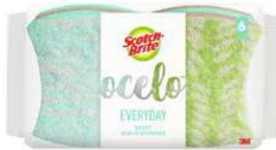
Scotch-Brite® ocelo™ No Scratch Scrub Sponge