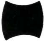
Scotch-Brite™ Power Pad 2000