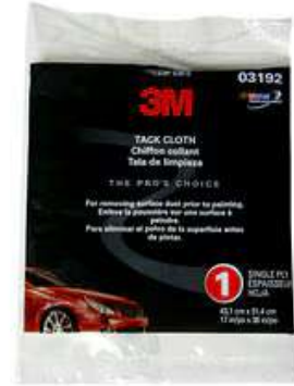
3M™ Tack Cloth