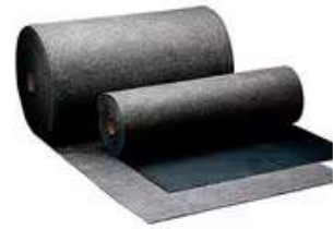
3M™ Maintenance Sorbent Rug