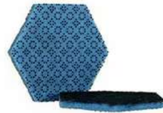
Scotch-Brite™ Low Scratch Scour Pad 2000HEX