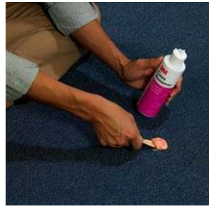
3M™ Gum Remover Ready-to-Use, 8 Oz, 6/Case