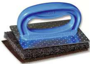
Scotch-Brite™ Griddle Pad Holder 461, 10/Case