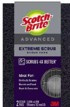
Scotch-Brite® Advanced Extreme Scrub Scour Pad