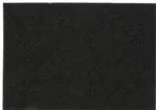
Scotch-Brite™ Black Stripping Pad 7200N, Black, 508 mm x 356 mm, 20 in x 14 in, 10... ea/Case