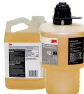
3M™ MBS Disinfectant Cleaner Concentrate 42