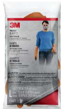
3M™ Refinishing Gloves