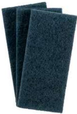
3M™ Doodlebug™ Blue Scrub Pad 8242