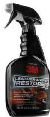
3M™ Leather and Vinyl Restorer