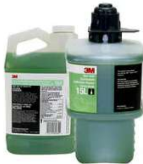
3M™ Non-Acid Disinfectant Bathroom Cleaner Concentrate 15L