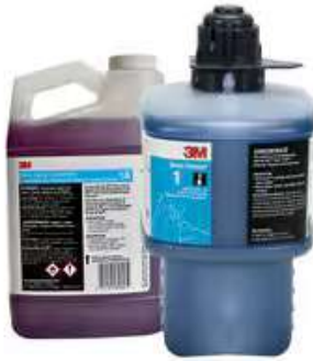
3M™ Glass Cleaner Concentrate