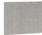
Scotch-Brite™ Griddle Screen 200