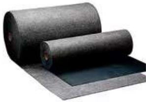
3M™ Maintenance Sorbent Rug