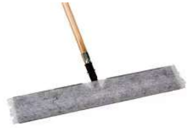
3M™ Easy II Holder