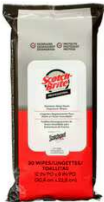
Scotch-Brite™ Stainless Steel Hood Degreaser Wipes with Scotchgard™ Protector, 30/Pack, 6 Packs/Case