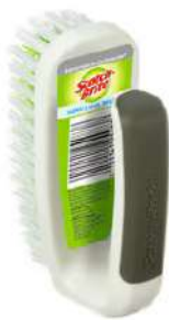
Scotch-Brite® Hand & Nail Brush