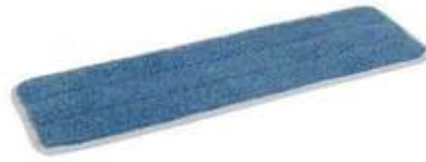
Scotchgard™ Floor Protector Applicator Pad, Blue, 18 in, 2/Bag, 5 Bags/Case