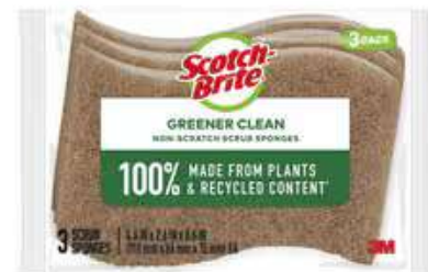
Scotch-Brite® Greener Clean™ Non-Scratch Scrub Sponge