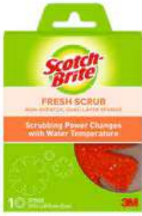
Scotch-Brite® Scrub Fresh Sponge 736-SP-1, 6/1