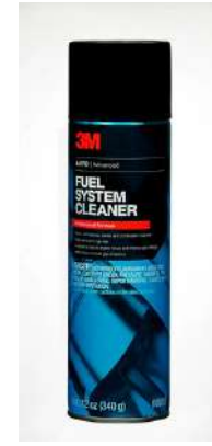
3M™ Universal Fuel System Cleaner