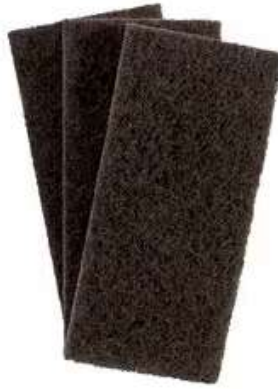
3M™ Doodlebug™ Utility Pad 8541, Brown, 4-5/8 in x 10 in, 5/Box, 4 Boxes/Case