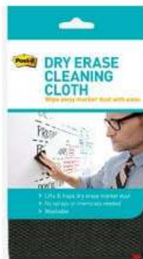
Post-it® Dry Erase Cleaning Cloth