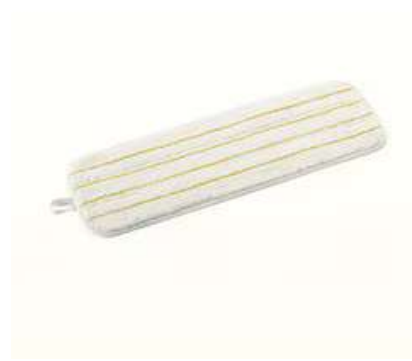
3M™ Easy Shine Applicator Pad