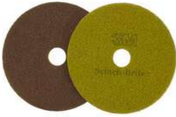
Scotch-Brite™ Sienna Diamond Floor Pad Plus