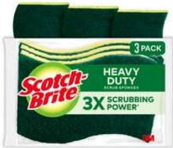
Scotch-Brite® Heavy Duty Scrub Sponge