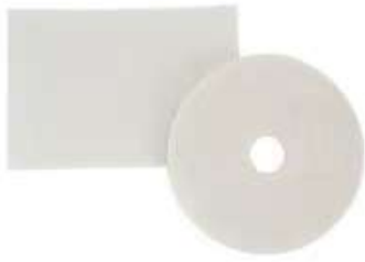
3M™ White Super Polish Pad 4100