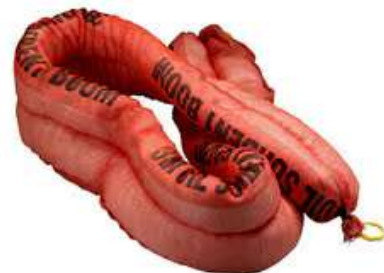
3M™ Oil Sorbent Boom