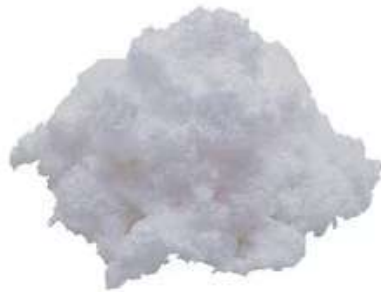
3M™ Petroleum Sorbent Particulate T-210, 1 Bag/Case