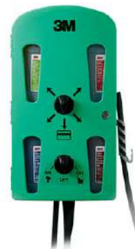
3M™ Flow Control System, Wall Mount