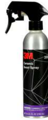
3M™ Ceramic Boost Spray 39905, 6/Case