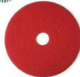
3M™ Red Buffer Pad 5100