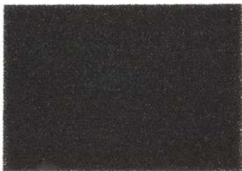
3M™ High Productivity Pad 7300