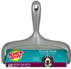
Scotch-Brite™ Large Surface Roller