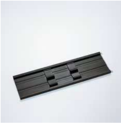
3M™ Easy Shine Pad Holder, 17 in, 1/Case