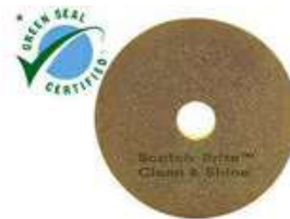
Scotch-Brite™ Clean & Shine Pad