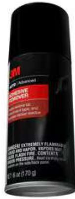
3M™ Adhesive Remover 38081, 5 Gallon (US)/18.9 L, 1/Case