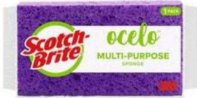
Scotch-Brite® ocelo™ Large Sponge 7264-T, 12/1