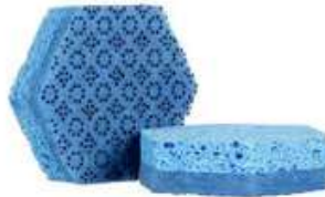
Scotch-Brite™ Low Scratch Scouring Sponge 3000HEX, 4/Pack, 4 Pack/Case