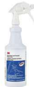
3M™ Glass Clean & Protector, 1 Quart, 12/Case