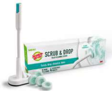
Scotch-Brite™ Scrub & Drop Toilet Cleaning System 559-SD- SK-4, 4/1