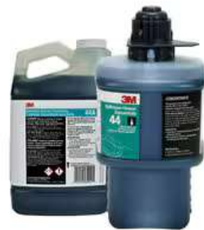
3M™ Bathroom Cleaner Concentrate 44L