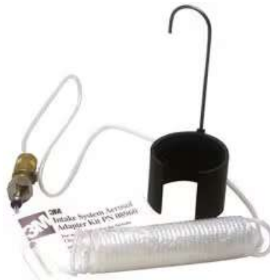
3M™ Intake System Aerosol Adaptor Kit