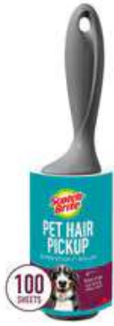
Scotch-Brite™ Pet Hair Roller