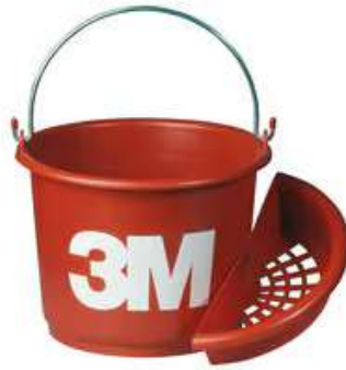
3M™ Wetordry™ Bucket, 02513, 10 per case