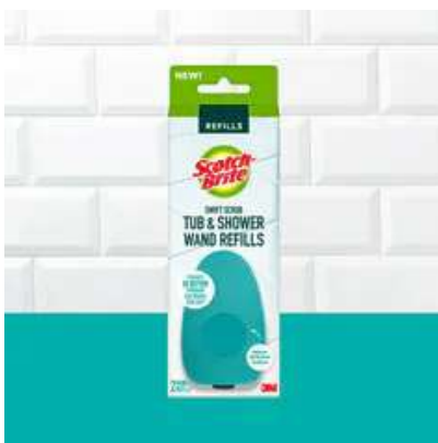
Scotch-Brite® Swift Scrub Tub & Shower Wand Refills 547-WR, 6/2