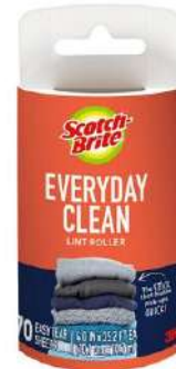
Scotch-Brite™ Lint Roller Refills