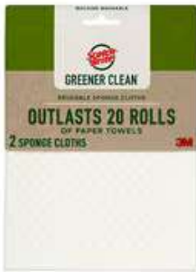
Scotch-Brite® Greener Clean™ Sponge Cloth 9055-ST, 12/2