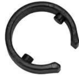
3M™ Easy Scrub Express Clip Ring 59224, 10/Bag