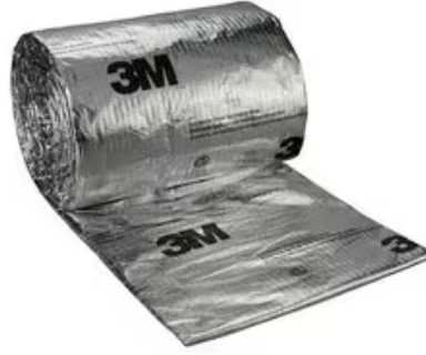
3M™ Fire Barrier Dryer Ventilation Wrap