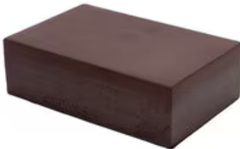
3M™ Fire Barrier Block B258, Maroon, 2.36 in x 5.12 in x 8 in, 12/Case