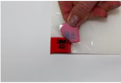
3M™ Clean-Walk Mat 5830 Series