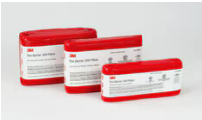
3M™ Fire Barrier Pillows