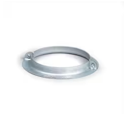
3M™ Fire Barrier Pass-Through Brackets Round