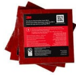
3M™ Fire Barrier Electrical Box Inserts