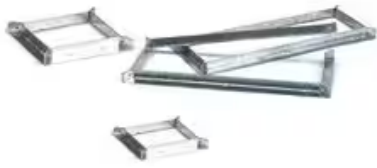
3M™ Fire Barrier Pass-Through Brackets Square