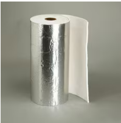
3M™ Interam™ Endothermic Mat E-54A