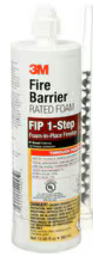
3M™ Fire Barrier Rated Foam FIP 1-Step