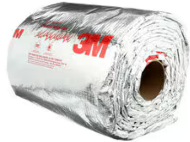
3M™ Fire Barrier Plenum Wrap 5A+