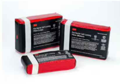
3M™ Fire Barrier Self-Locking Pillows