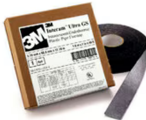
3M™ Fire Barrier Ultra GS Wrap Strip, 2 in x 40 ft, 5 Rolls/Case