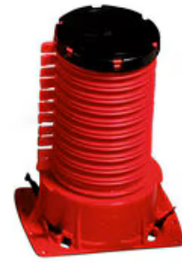
3M™ Fire Barrier Cast-In Devices for Metal Pipes