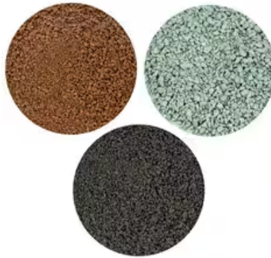
3M™ Cool Roofing Granules