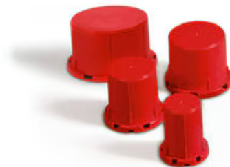
3M™ Fire Barrier Cast-In Device Height Adaptors