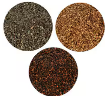
3M™ Blended Roofing Granules