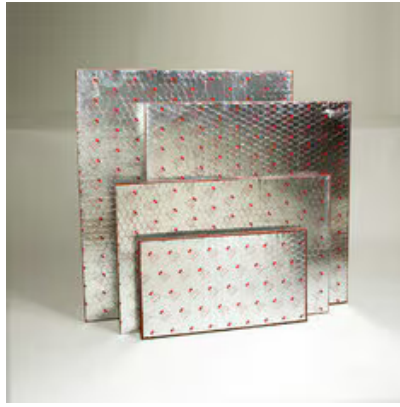
3M™ Fire Barrier Composite Sheet CS-195+