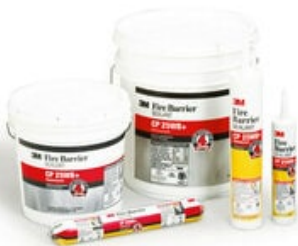
3M™ Fire Barrier Sealant CP 25WB+