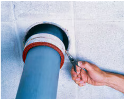
3M™ Fire Barrier Wrap Strips FS-195+, 2 in x 24 in, 10 Each/Case