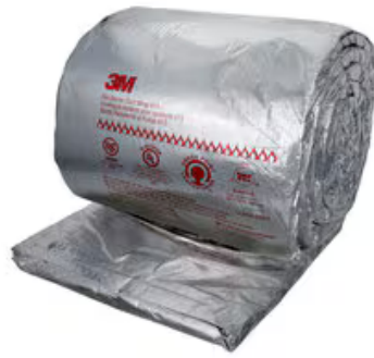
3M™ Fire Barrier Duct Wrap 615-24 1.5in x 24in x 25 ft, 1 Roll/Case