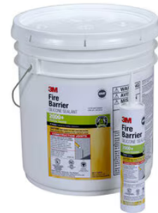
3M™ Fire Barrier Silicone Sealant 2000+