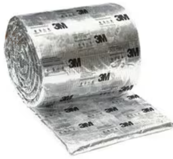
3M™ Fire Barrier Duct Wrap 615+