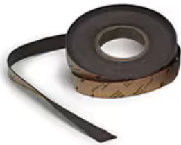
3M™ Expanrol Flexible Intumescent Strip E-FIS, Adhesive-Backed, Black, 1/16... x 1/2 in x 50 ft, 10 Rolls/Case