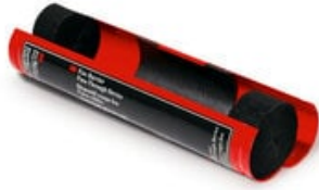
3M™ Fire Barrier Pass-Through Devices Round