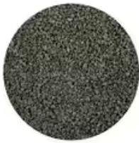
3M™ Smog-Reducing Granules