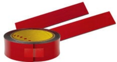
3M™ Fire Barrier Tuck-In Wrap Strips