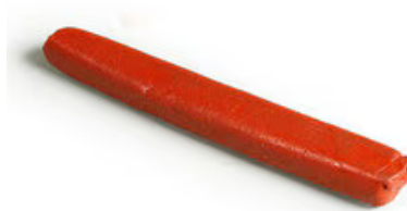
3M™ Fire Barrier Moldable Putty Stix MP+