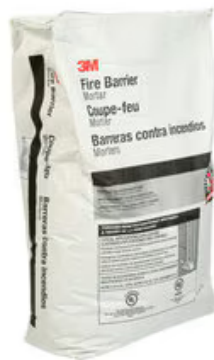
3M™ Fire Barrier Mortar