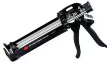
Albion® Manual Dispenser, 1/case