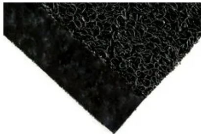
3M™ Nomad™ Heavy Traffic Entrance Matting 8100