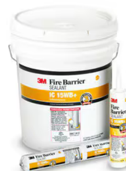
3M™ Fire Barrier Sealant IC 15WB+