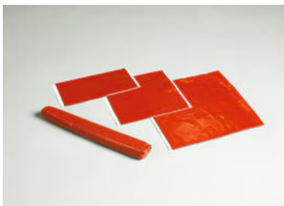
3M™ Fire Barrier Moldable Putty Pads MPP+