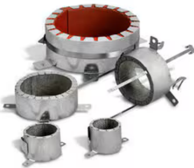
3M™ Fire Barrier Plastic Pipe Device