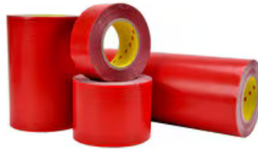
3M™ Fire and Water Barrier Tape