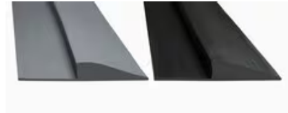
3M™ Mat Edging Roll