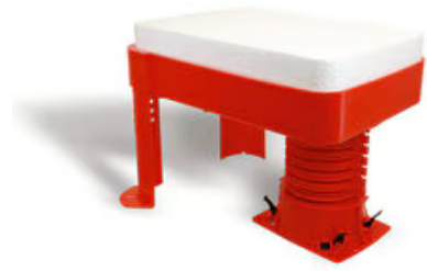
3M™ Fire Barrier Cast-In Tub Box Assembly 3TB, 3 in, 6/Case