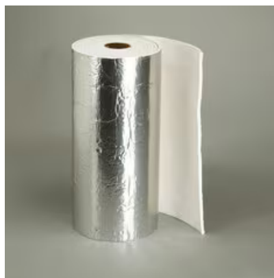
3M™ Interam™ Endothermic Mat E-54A