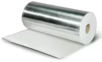
3M™ Interam™ Endothermic Mat E-5A-4, 24.5 in x 20 ft, 1 Roll/Case