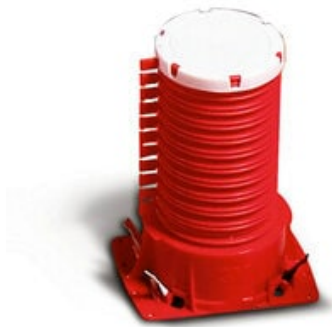
3M™ Fire Barrier Cast-In Devices for Plastic Pipes