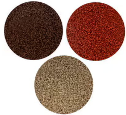
3M™ Classic Roofing Granules