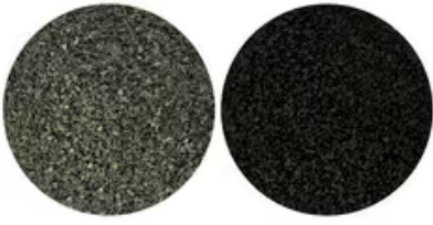
3M™ Headlap Roofing Granules