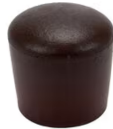
3M™ Fire Barrier Plug PLG2, 2 in, Maroon, 4/Case