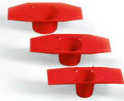
3M™ Fire Barrier Cast-In Device Metal Deck Adaptors