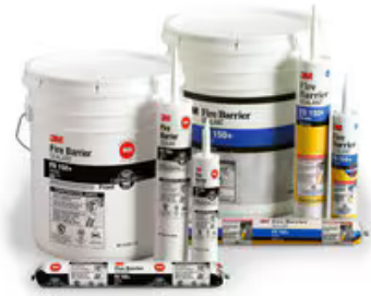
3M™ Fire Barrier Sealant FD 150+