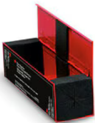
3M™ Fire Barrier Pass-Through Device PT4SD, 4 in Square, 6/Case