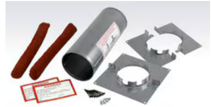
3M™ Fire Barrier Putty Sleeve Kits