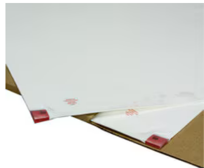
3M™ Clean-Walk Replacement Pad 5842, White, 30 in x 24 in, 60 Sheets Per Pad, 2 Pads P... Case