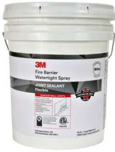
3M™ Fire Barrier Water Tight Spray