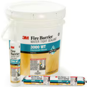
3M™ Fire Barrier Water Tight Sealant 3000 WT