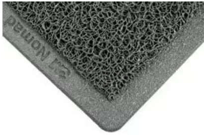
3M™ Nomad™ Medium Traffic Entrance Matting 6050