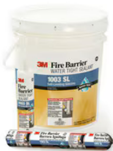
3M™ Fire Barrier Water Tight Sealant 1003 SL