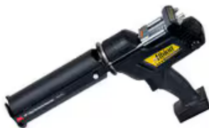
Albion® Battery Operated Power Dispenser, 1/case