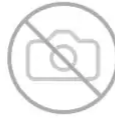
3M™ Nomad™ Scraper Matting 8200, Unbacked Scraper, D/Grey, 1.2 m x 6.0 m, 1... Roll/Case