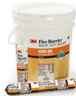
3M™ Fire Barrier Water Tight Sealant 1000 NS