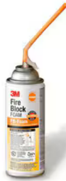
3M™ Fire Block Foam, Orange, 12 fl oz, 12 Can/Case