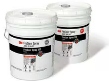
3M™ FireDam™ Spray 200