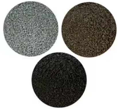
3M™ Copper Roofing Granules