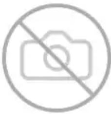
3M™ Nomad™ Scraper Matting 8200, Unbacked Scraper, D/Grey, 1.2 m x 9 m, 1 Roll/... Case